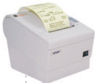
Check-in Boarding Pass and Bag Tag

These two solutions speed a lot the check-in service and create a new and dynamic way of passengers assistance.